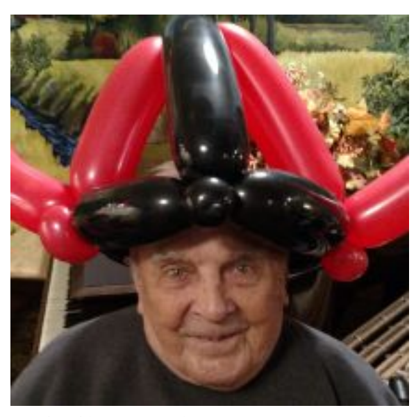
Our 29th Annual Community Trick-or-Treat Monster Bash.